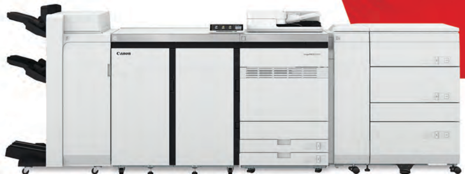
imagePRESS V1000 shown with optional accessories.