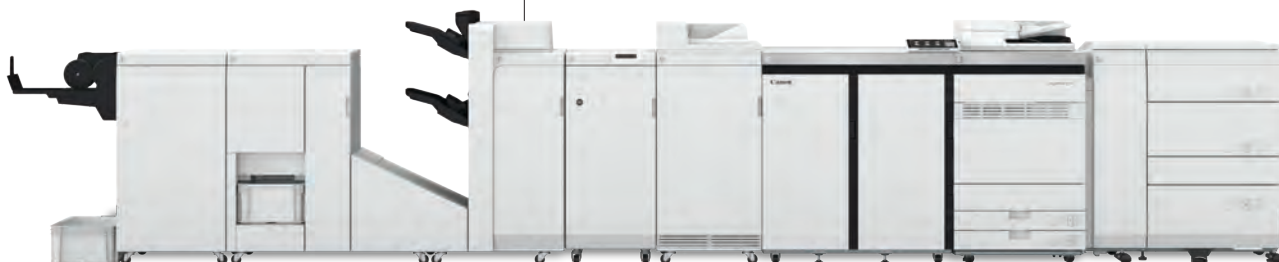
imagePRESS V1000 shown with optional accessories.